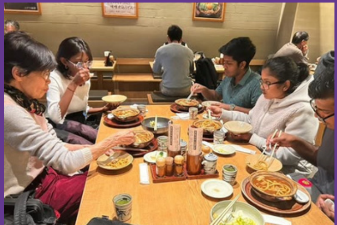
Our students celebrating their success