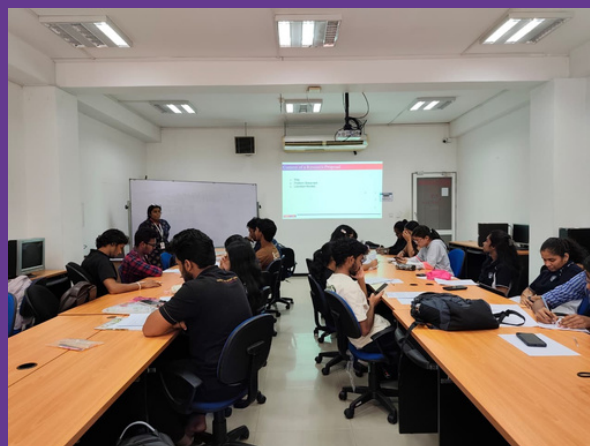
Students participating in AI based Research Workshops