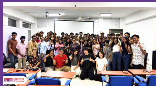
Students participating in the event