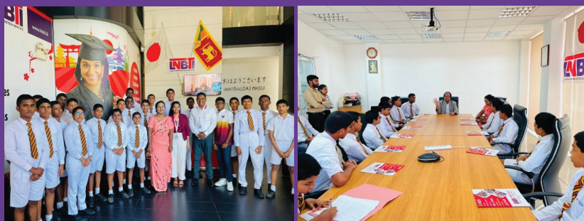
Students of Ananda Collage Visited LNBTI

In addition, students from Ananda College, Colombo visited the LNBTI campus, engaging in interactive sessions and cultural demonstrations. The visit provided a meaningful opportunity for young learners to experience the unique blend of Japanese technology and culture that defines LNBTI's learning environment.