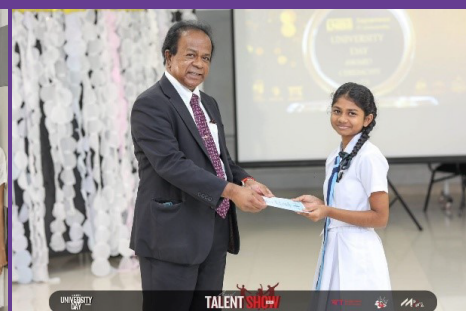
Recognizing and honoring the remarkable achievements of students