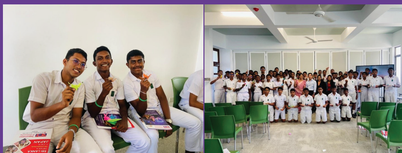
LNBTI shared Japanese Culture with Isipathana Collage's Students