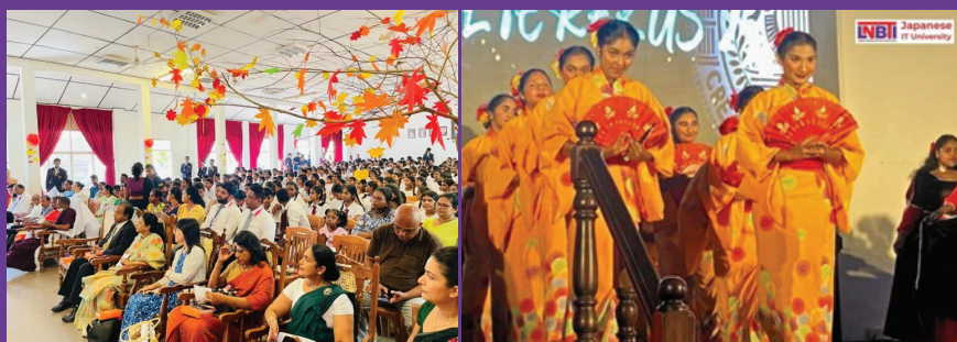
LNBTI took a Part in Japanese Day of Wesley College, Colombo and Ananda Collage, Chilaw.