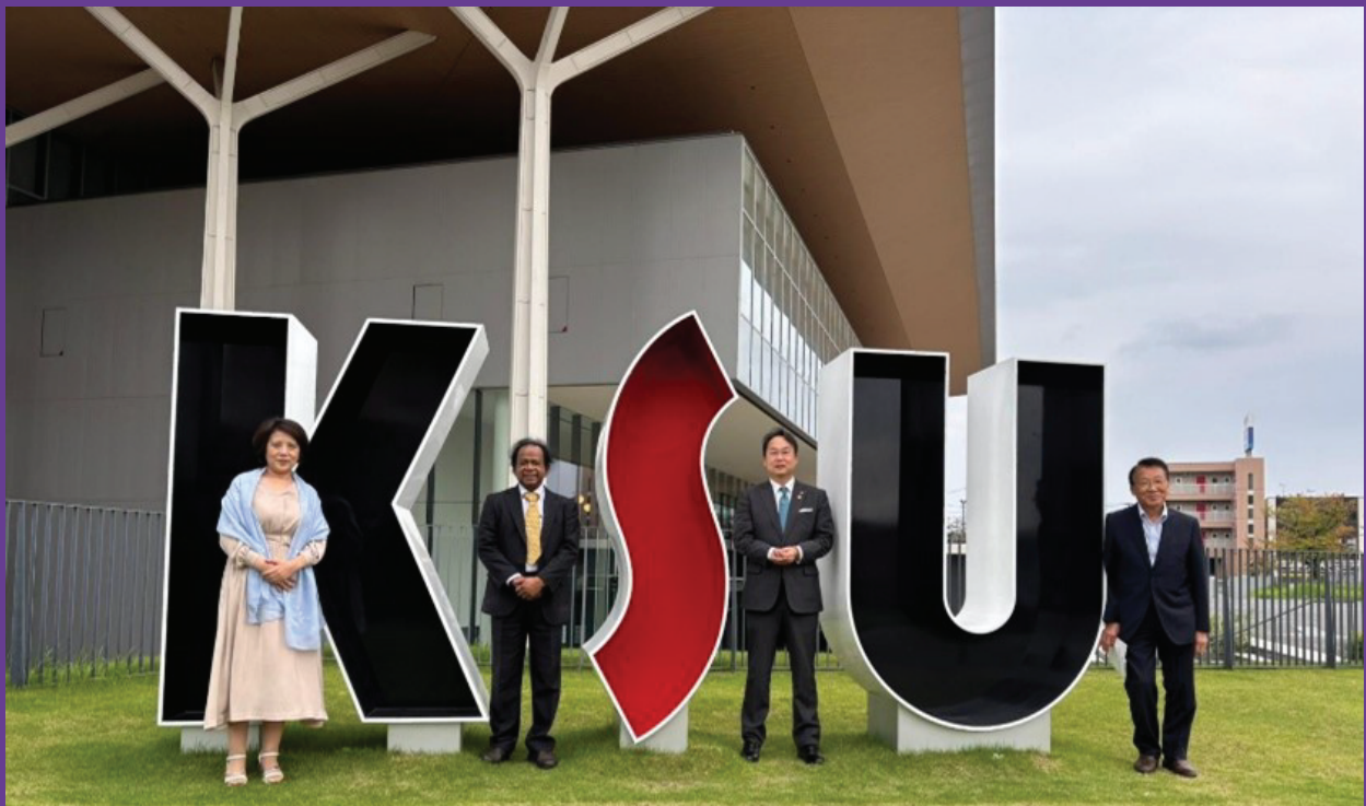
The vice-chancellor of LNBTI with Academic Staff of KSU

The MOU highlights LNBTI's continuous commitment to building bridges between Sri Lanka and Japan, empowering students with world-class learning experiences and international career pathways.