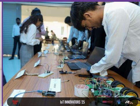
LNBTI IoT Innovators are presenting outstanding projects