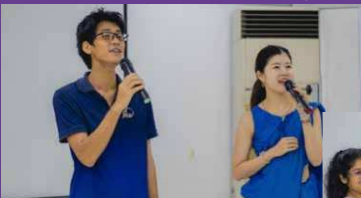
Dive into the Heartbeat of Sinhala Tunes: Sinhala song by JICA Volunteers