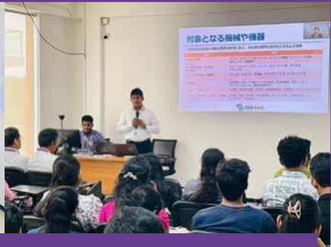
The Vice Chancellor is emphasizing the importance of the seminar