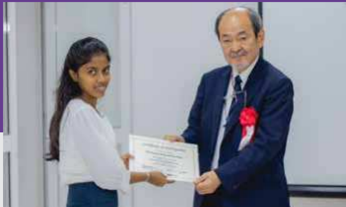
Receiving an award certificate from the Senior Advisor of LNBTI

Extracurricular Activities: Active participation in extracurricular activities, including clubs, sports, cultural events, and community service.