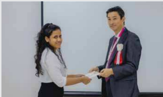
Receiving an award certificate from the Chairmen of LNBTI