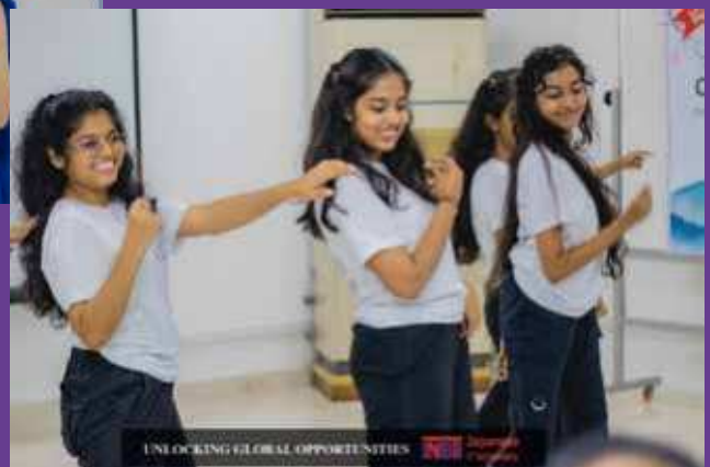
Presenting a J-Pop dance