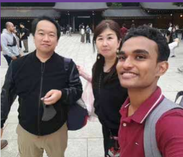
Visiting historical places in Japan with the company staff

I wholeheartedly recommend LNBTI Japanese IT University for any student who wish to pursue an international career in IT. It offers numerous opportunities for internships in Japan. By joining LNBTI, you can elevate your skills and career to a global level.