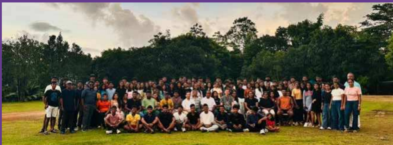
Clicking Happy Moments with the LNBTI Family

little break from studying. Everyone was able to rejuvenate, take stock of the year's accomplishments, and return to their academic endeavors with newfound vigor and perspective.