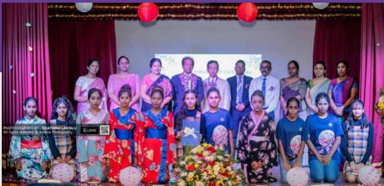
Japanese Club members of Kolonnawa Balika Vidyalaya