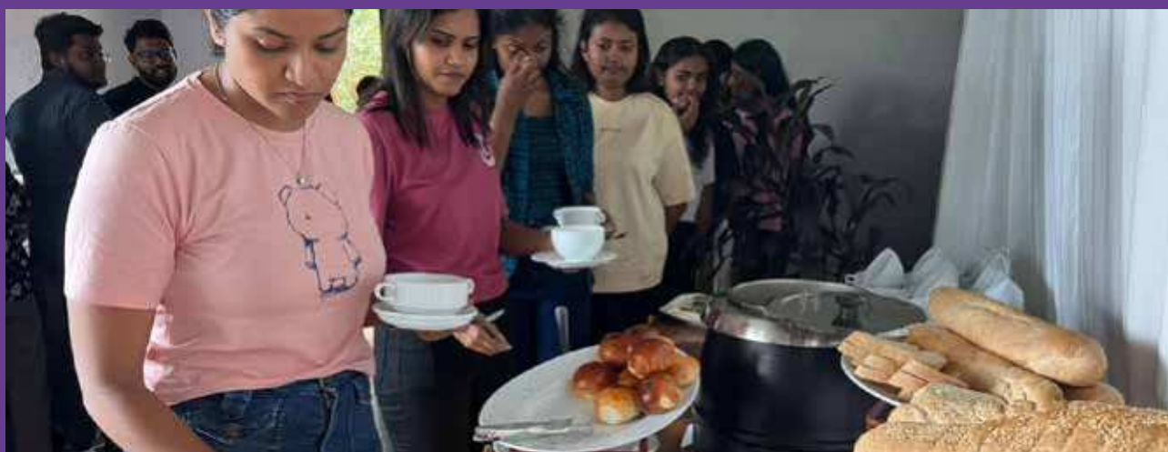
Tasty Treasures in the Great Outdoors