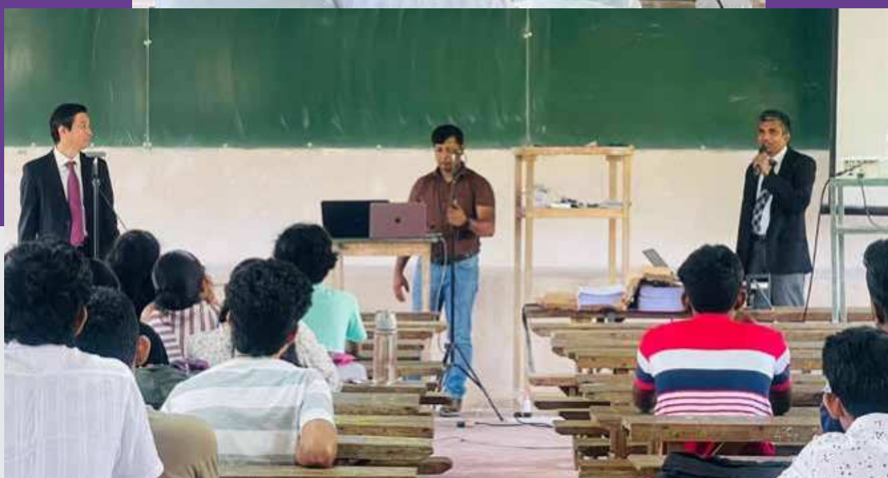
The Vice Chancellor and the Chairman are explaining the increasing demand for IT specialists in Japan.