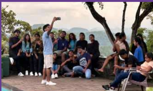
Captured some wonderful snapshots