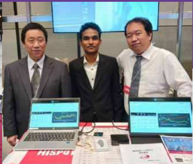
At the company