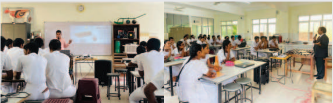
IoT Seminar at Homagama Central College