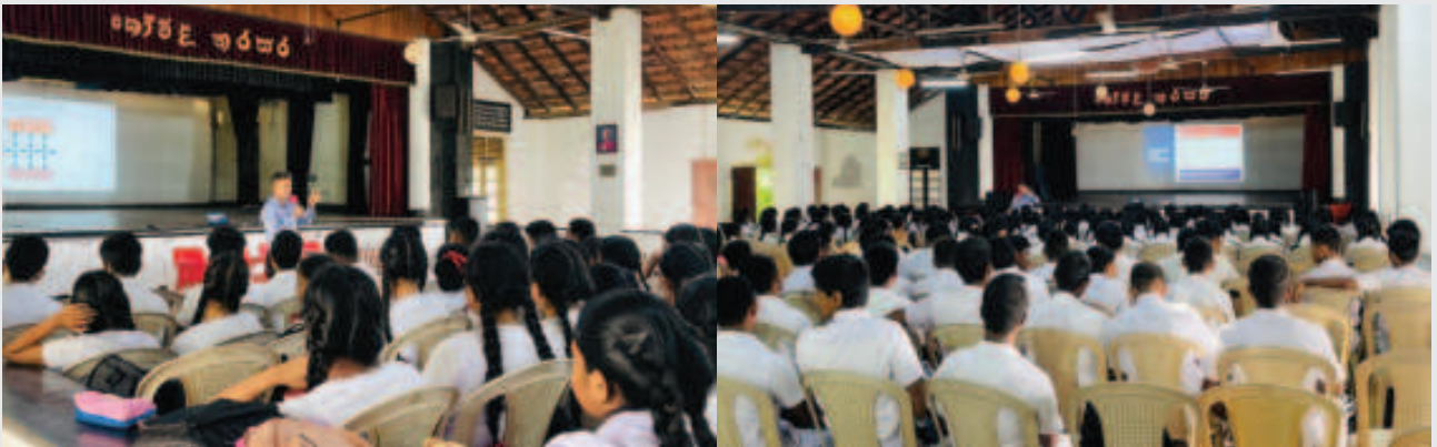
IoT Seminar at Panadura Balika Maha Vidyalaya