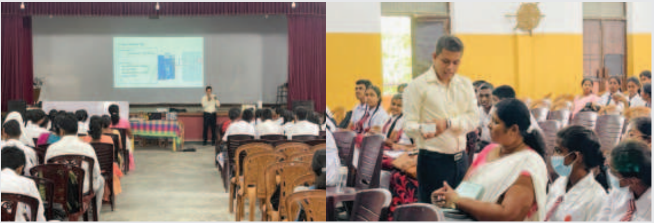
IoT Seminar at Gurulugomi Vidyalaya