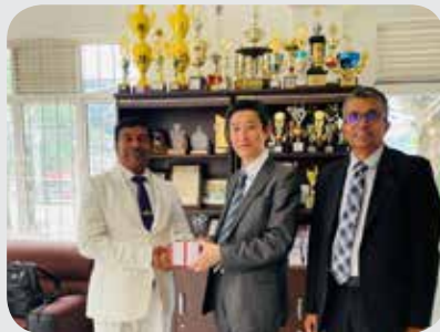
Badulla Central College