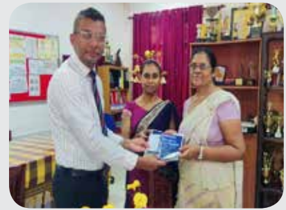
Homagama Central College