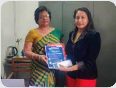
Devi Balika Vidyalaya-Colombo