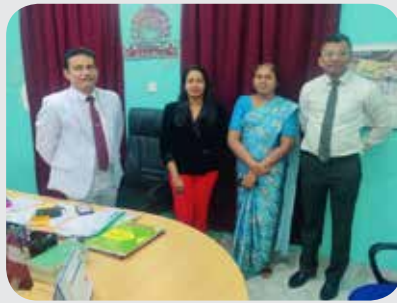
Nalanda College -Colombo