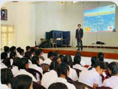
Bandarawela Central College