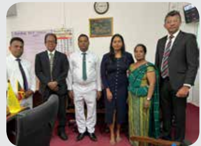
Anuradhapura Central College